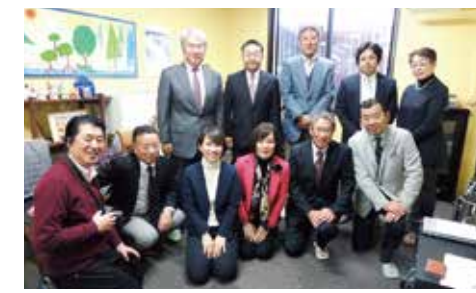
Observing progressive businesses

It is said that we have reached the age where people live 100 years. The average life span in Tochigi Prefecture in 2015 was 80.10 years for men (ranked 42nd in the nation) and 86.24 years for women (ranked 46th in the nation) and has stagnated at a low rank nationally. This trend has not changed for a long time. To compensate for this situation, we are conducting research on preventive medicine and health promotion in order to achieve "Tochigi, the prefecture of health and longevity" by focusing on the health of people, who are the source of everything.